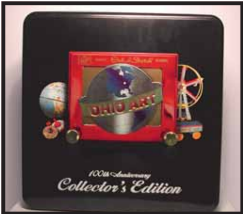
GRAND AWARD Ohio Art, Bryan, Ohio 100th Anniversary Container

We will once again conduct our Competition in May, 2010. We have sent out entry forms to those who participated in the past and to those perspective companies who we think should send entries. Now is the time to gather all of those award winning decorated products to submit into what we would like to be, our best ever showcase of what the metal decorating industry has to offer.